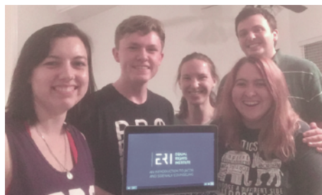
A group of students from Louisiana who are taking the Sidewalk Counseling Course together!